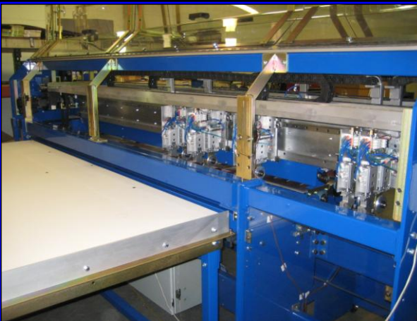
Rugged - Transparent - Accessible